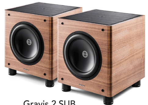
Gravis 2 SUB (Left and Right)