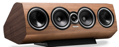
Sonetto Center II