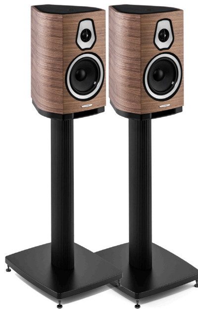
Sonetto II (Rear)