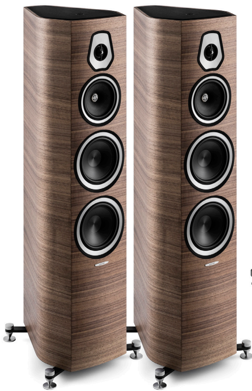
Sonetto V (Left and Right)

We designed this Sonus Faber Home Theater System for those who refuse to compromise on their cinematic experience, period. With the Sonetto V floor-standing speakers for the front channels, Sonetto Center II center-channel, Sonetto II bookshelf speakers for the rear channels, four PC 662 in-ceiling speakers for the ATMOS channels and not one but TWO Gravis II sub-woofers, this system is ready to take on any challenge you throw at it. Family movie-nights are going to be the new highlight of your week!