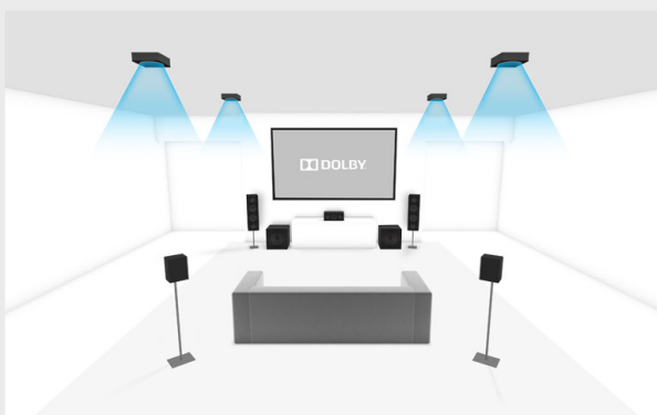
Perspective detail for 5.1.4 setup

This refers to how many overhead or Dolby Atmos enabled speakers you can use in your Dolby Atmos capable setup.